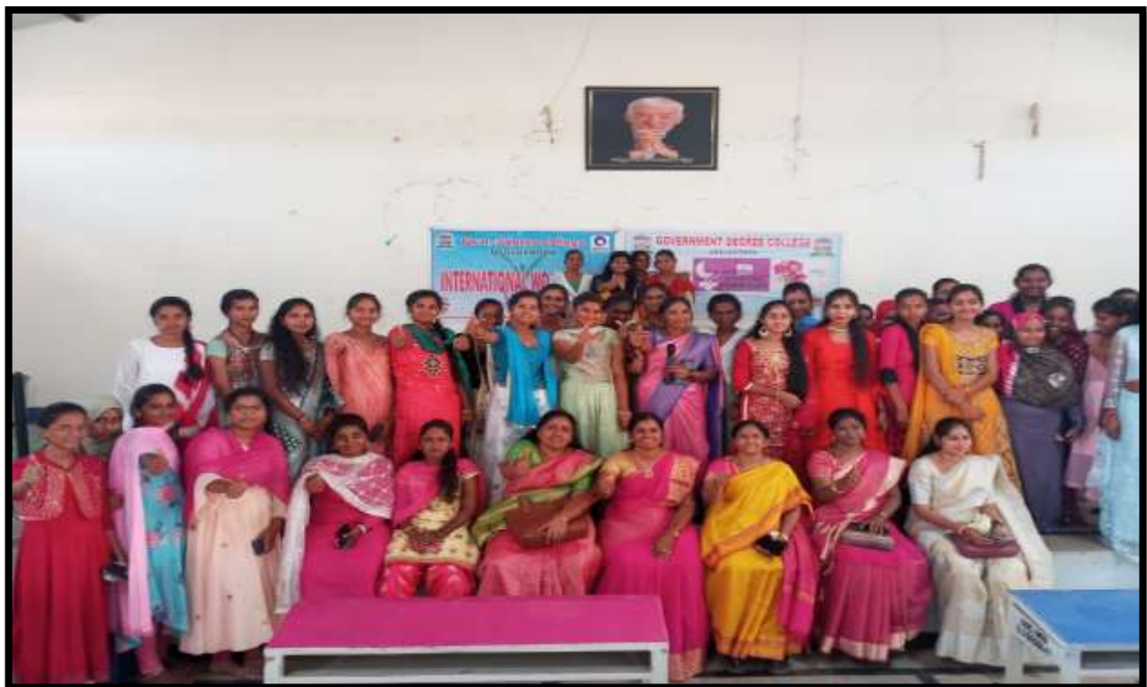
All the teaching, non teaching women staff members and Girl Students are participated in International womwn's Day Cellabrations.